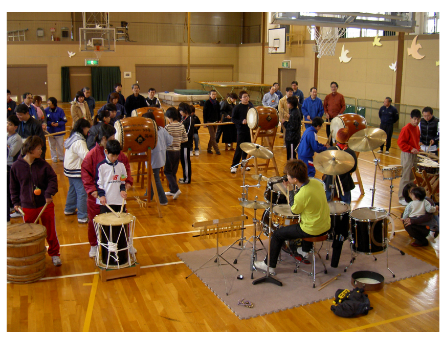
5 Year Anniversary