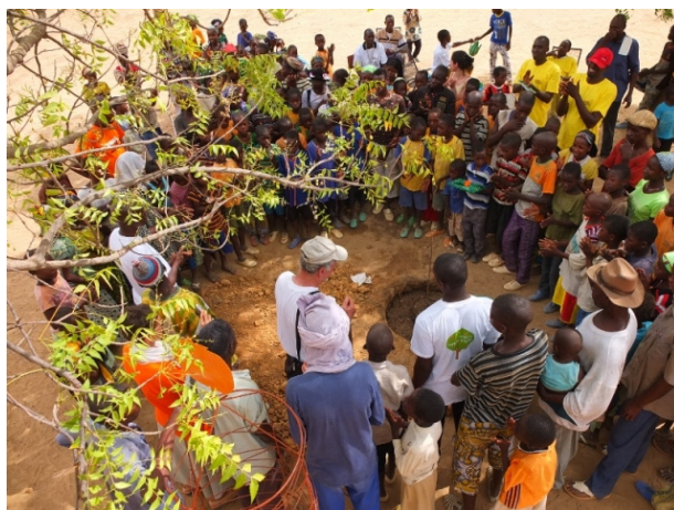
plate to be set up beside the tree was made, strategies to protect the tree planted in the bush from animals were considered, and a hole and soil for planting were prepared, as well as a theater piece was rehearsed. A drawing and writing contest

A number of various activities already took place a few days before the ceremony. The