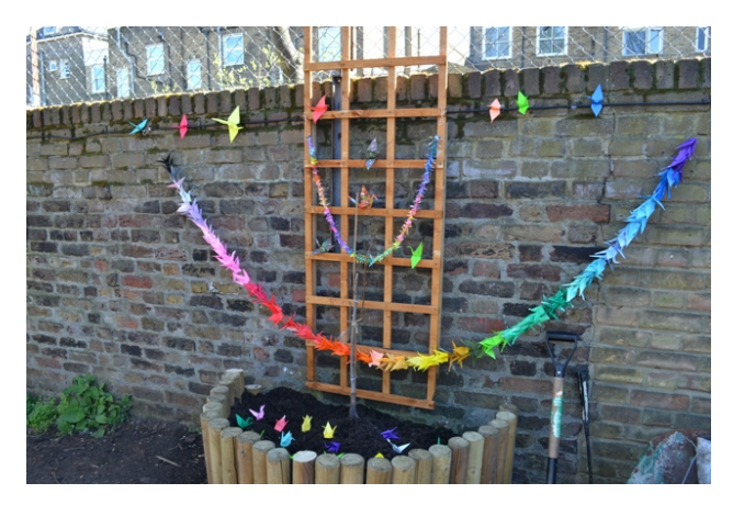
children nurtured a positive mood to welcome the tree.

Fortunately, they had great weather on 24 March, the day of the ceremony, and they hung a thousand origami cranes at the planting site. Children, teachers, parents and local residents participated in the ceremony. They said that they felt the "spirit" of the Kaki Tree Project.